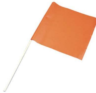
Approved Fluorescent Orange Flag

2.6.3 BEACONS: When specified, the permitted vehicle's beacon or light bar shall be amber in color and shall be of a high-intensity rotating, flashing, oscillating, or strobe style. The beacon shall be roof mounted or mounted as close to the vehicle's roof line as practical. The beacon/strobe shall be visible for a minimum of 500 feet, shall be visible through a full 360 degrees, and shall be maintained for operability.