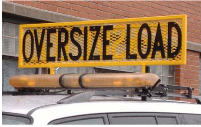
Approved Manufactured Sign