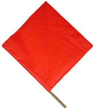
Approved Red Flag

2.6.2 FLAGS: When specified, shall be square and a minimum of 16 inches on each side. Flags must be kept clean and clearly visible during the entire trip. They must be either red or fluorescent orange in color.