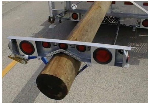
Example of an Extended Light Bar

8.2.2.3 Must have either an extended light bar or a rear pilot/escort vehicle.