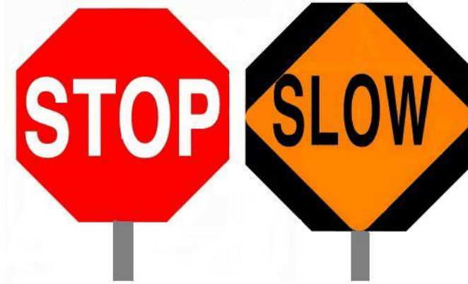
Approved Stop/Slow Paddles