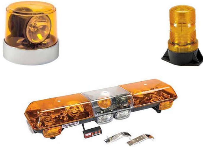
Examples of Approved Amber Beacon and Light Bar

2.6.4 RADIOS: All permitted vehicles requiring a pilot/escort vehicle, except roaded construction equipment and other specialized vehicles, shall be equipped with an operating Citizens Band (CB) radio. Company radios may also be used in addition to the CB radio for inter-vehicle communication.